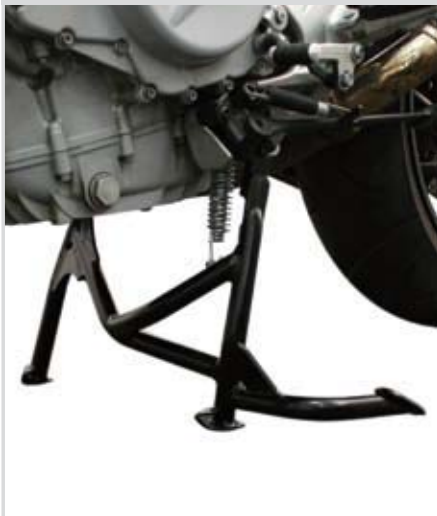
BMW F 800 S / F 800 ST.