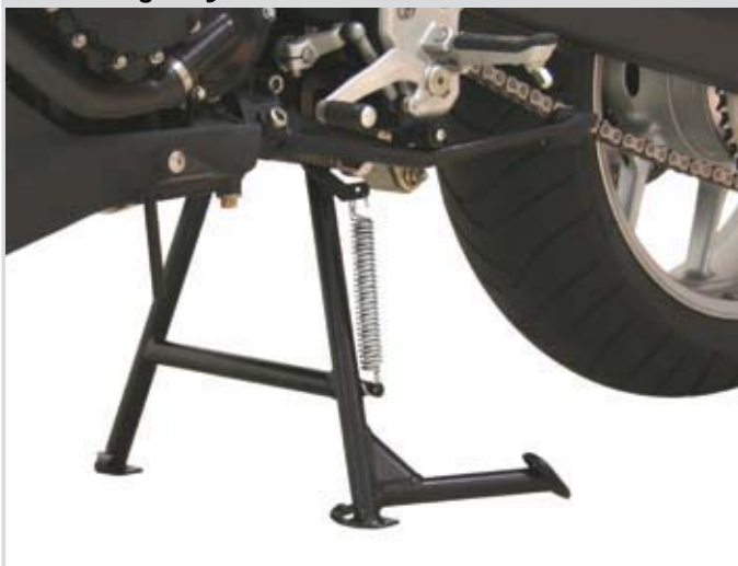
TRIUMPH Tiger 1050.