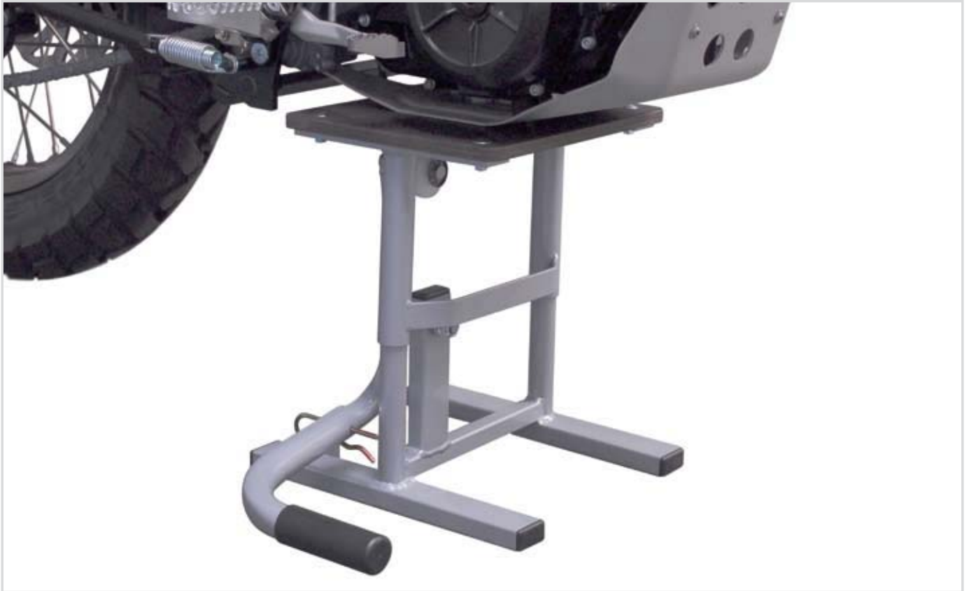
Maintenance Stand M (orange).