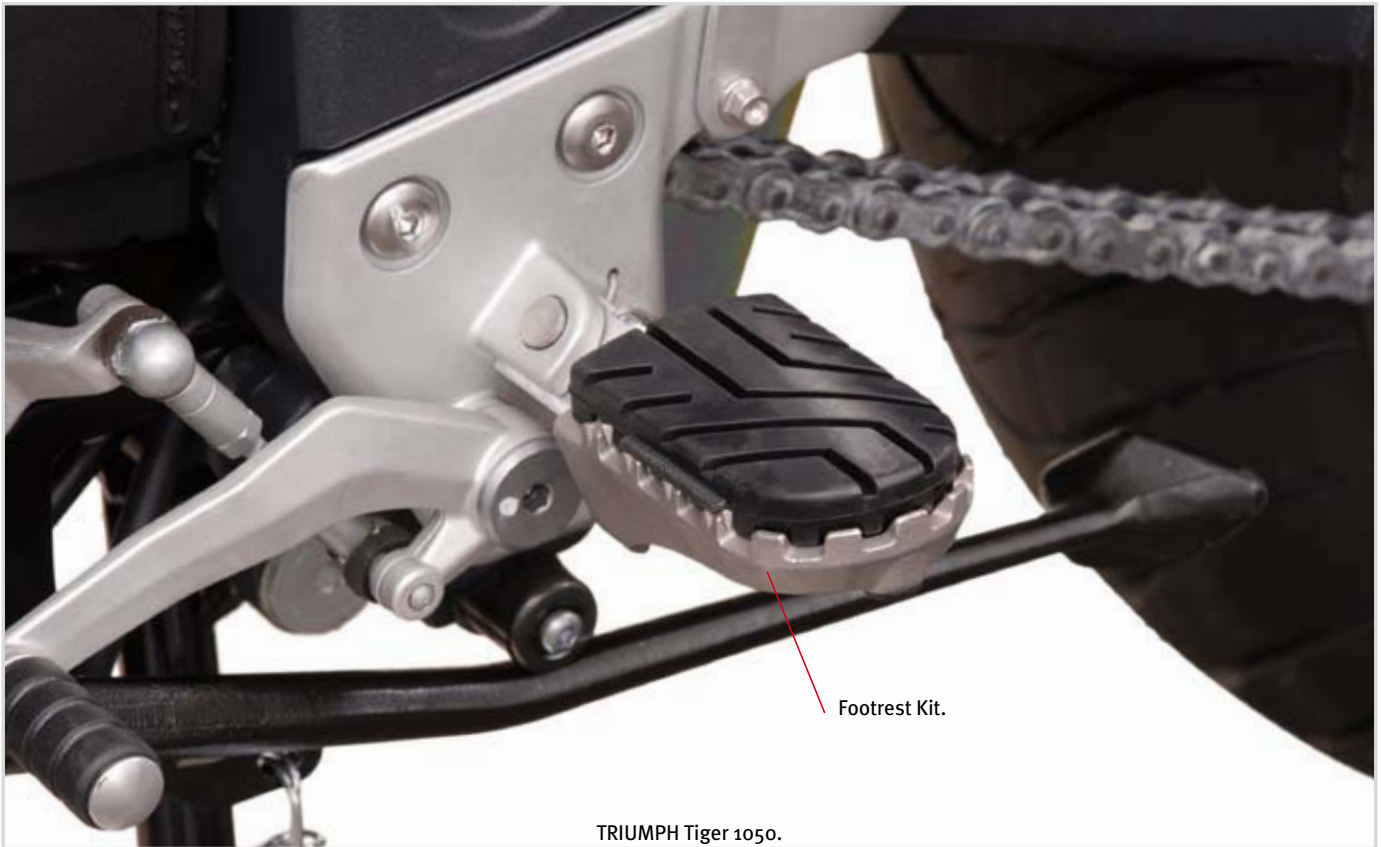
TRIUMPH Tiger 1050.