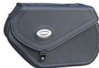
Lockable 150 bag, made of Iparex